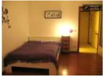
KölnGratis Pool & Sauna im SzeneviertelGraeffstraße, 50823 Köln, DeutschlandJetzt Buchen!39,00 €Neu